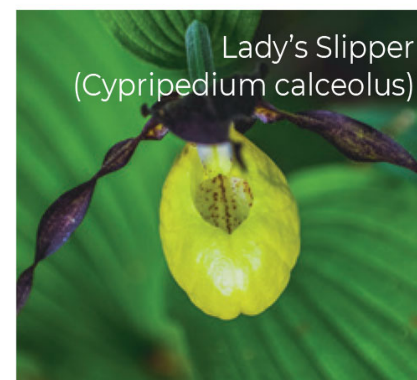
Lady's Slipper (Cypripedium calceolus)

But about 30,000 years ago, the image of Jezersko was much different than it is today. Due to the colder climate, the forest did not thrive here, the slopes were bare, and a glacier slowly crept down the valley from the mountains. About 12,000 years ago, it became warmer again, and the glacier disappeared in a few centuries. The transformation of the surface was taken over by slope processes and flowing water, creating the present-day image of the valley of Jezersko. The glacier from the valley of Makekova Kočna closed the Jezernica stream's outflow towards the Kokra River valley for a while, so a lake formed at the bottom of the lake basin, which remained long after the glacier retreat. The valley of Jezersko was named after the lake that used to fill the entire central part of the basin.